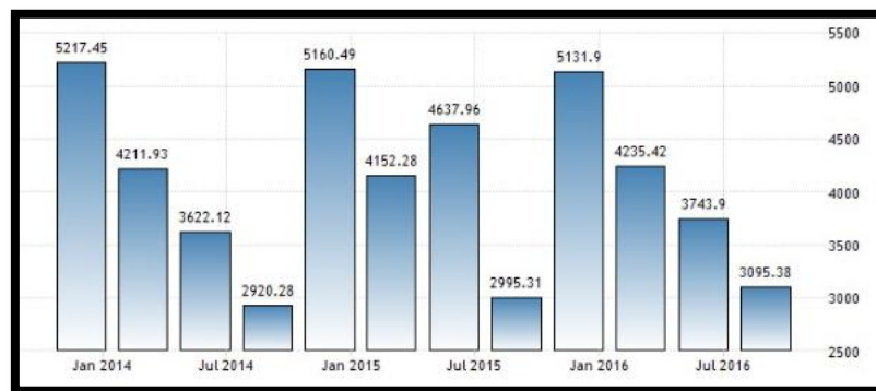
India GDP from Agriculture

Demonetisation has affected every Indian, but it has hit the agricultural sector badly. Agriculture in India accounts for 50 percent of the workforce. Farmers, who are the backbone of our economy, were severely affected by the note demonetization of 8 November 2016. Agriculture is impacted through the input-output channels as well as price and output feedback effects. Sale, transport, marketing and distribution of ready produce to mandis is dominantly cash-dependent. Farmers suffered a setback due to nationwide cash shortage and a fall in the demand for vegetables in wholesale markets. . Farmers were not able to purchase inputs like seeds from market. They were using old seeds from the last year harvest and not purchasing new quality seeds from market. In northern Indian states, the crop of rice was prepared. Some of the farmers have sold their crops, and some was in the process. It is true that almost crops are sold in cash the transaction which has been done is cash is to be deposited in the banks and can be withdrawn accordingly. The consumers of rural farmer are not as progressive as the urban middle class, which can be easily managed with a very little amount of cash. The problem of the demonetization is largely associated with the rural areas of the country have lesser number of banks and ATMs compared to the urban areas