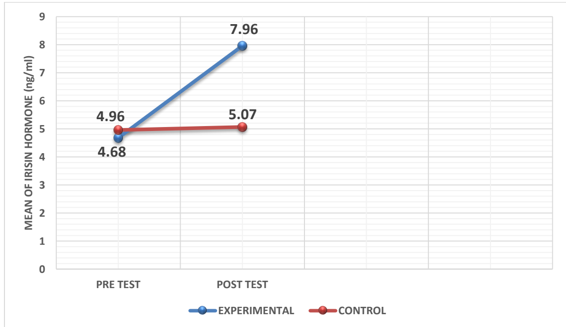
Fig.1: Graphical representation of pre-post scores of experimental and control groups on irisin hormone

The result of post-test comparison of mean values of irisin hormone revealed that the mean value of experimental group is higher than the control group ( t=3.69 , p<0.05 ) (Table 3). This indicates that yoga exercise training was found effective in producing irisin hormone in the blood, which perhaps helped to burn excessive body fat among the obese people.